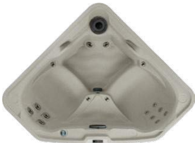
Tristar shown in Sand