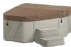
Sand shell with Caramel cover

freeflowspas.com facebook.com/freeflowspas instagram.com/freeflowspas Customer Service: (888) 961-7727