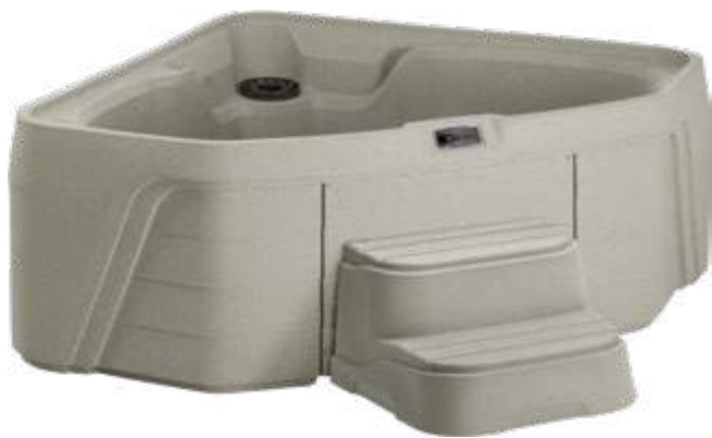
Tristar shown in Sand