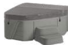
Taupe shell with Slate cover