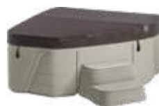
Sand shell with Chestnut cover